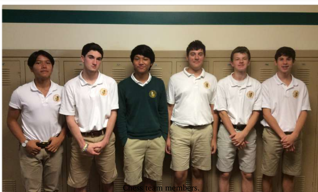
Chess team members.

Friday Oct. 20 Grilled Chicken Peas Cottage Cheese